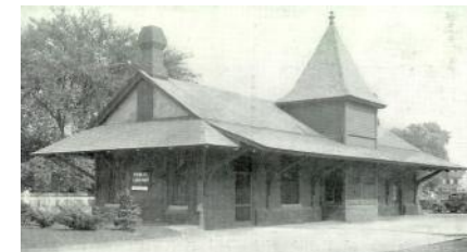
LIBRARY'S PREVIOUS LOCATION IN WESTERN MARYLAND RR STATION 1936-1957