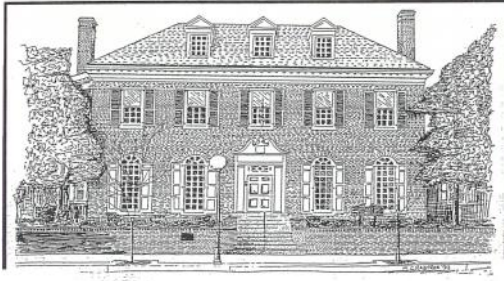
M. Crabtree 1992