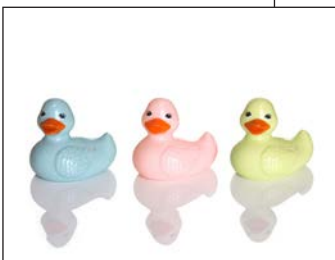
Baby Shower or New Baby