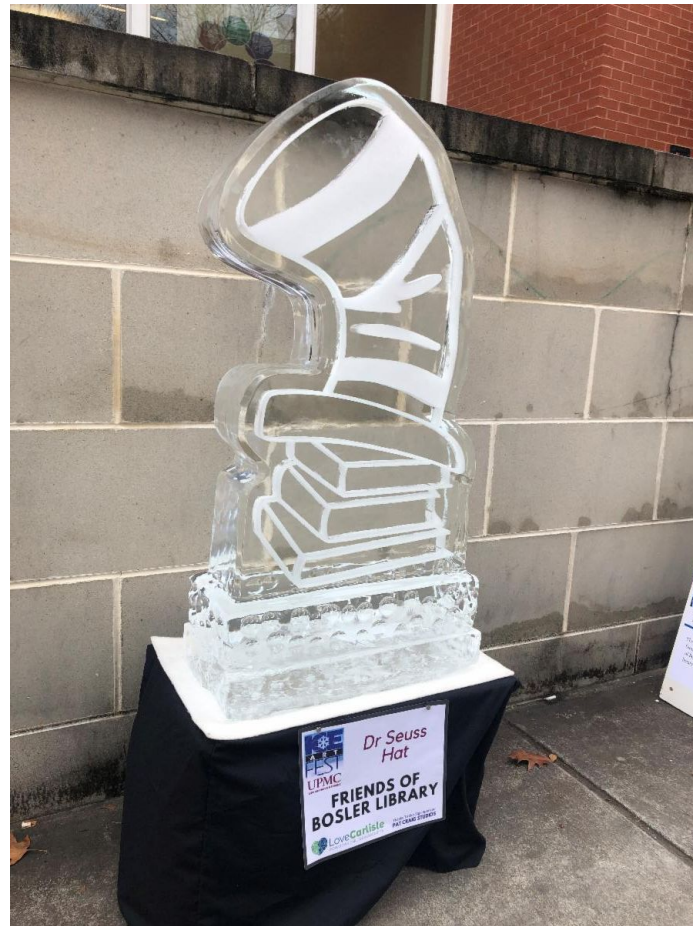
The Friends of Bosler Memorial Library Dr. Seuss Hat for Downtown Carlisle Association's Ice Art Fest!