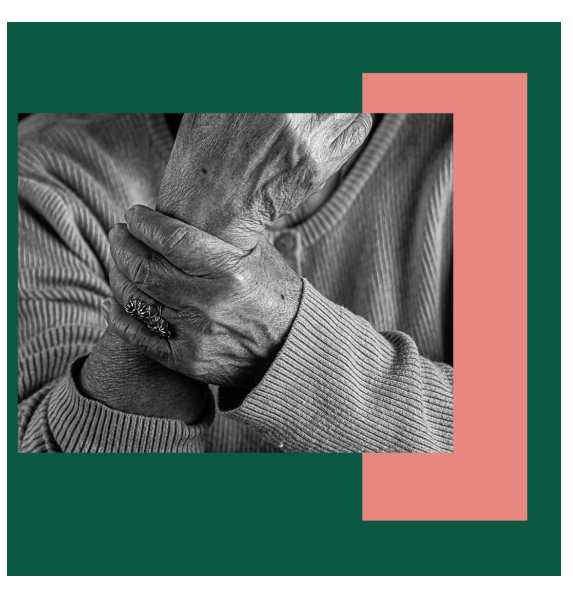
Living Well with Parkinson's Disease

Carlisle Institute for Lifelong Learning (Adult Programs) Program Guide