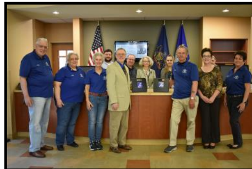
Bosler staff with Carlisle Area Sertoma Club.

These 1 to 1 hearing loops allow customers with t-coil fitted hearing aids to freely engage with staff at counters or in situations where interaction between two people takes place.