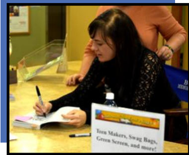
Maggie Stiefvater signing books at Bosler's 2018 Celebrate the Book Week.